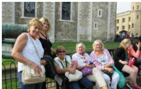
Raynes Park Residents' Association