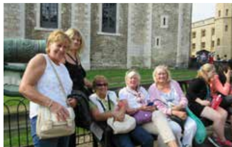
Raynes Park Residents' Association

Jubilee Way, Chessington, KT9 1TR Tel: 020 8397 7025 www.kgfindoorbowlsclub.co.uk