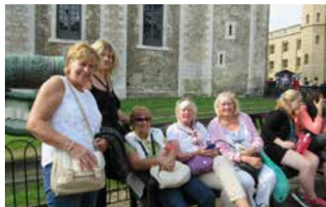
Raynes Park Residents' Association