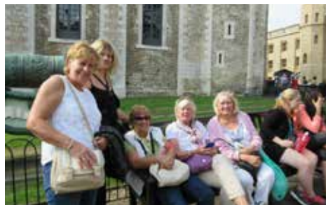
Raynes Park Residents' Association