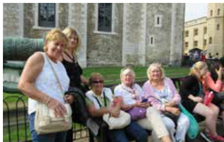
Raynes Park Residents' Association