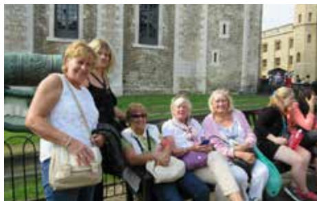
Raynes Park Residents' Association